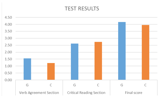
Figure 2: Test results.